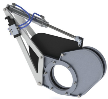
HIGH PRESSURE BLAST GATES