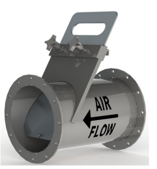
BALANCING SLIDE GATES