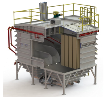
REVERSE AIR CLEANING FILTERS