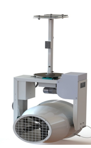
OVERHEAD OSCILLATING AIR CIRCULATION FANS