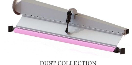
DUST COLLECTION HOODS