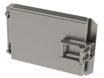
QUICK OPENING ACCESS DOORS