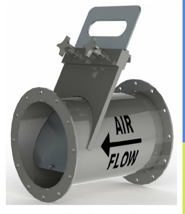
BALANCE SLIDE GATE

64 CIRCLE FREEWAY DR CINCINNATI, OH 45246